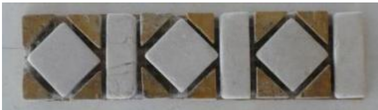
Border N° 4