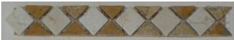
Border N° 3