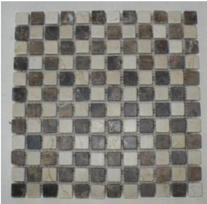
Border N° 8