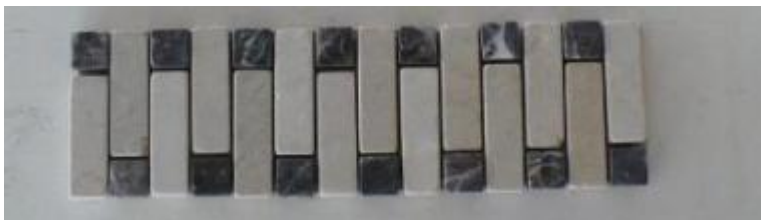
Border N° 5