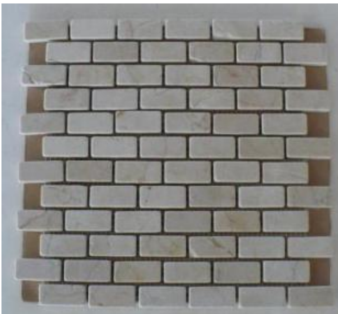
Border N° 9