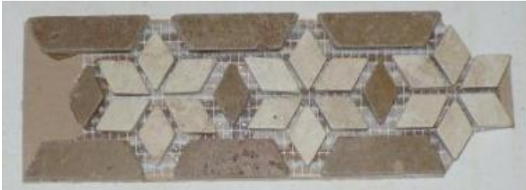
Border N° 7