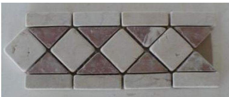
Border N° 6