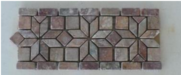
Border N° 2